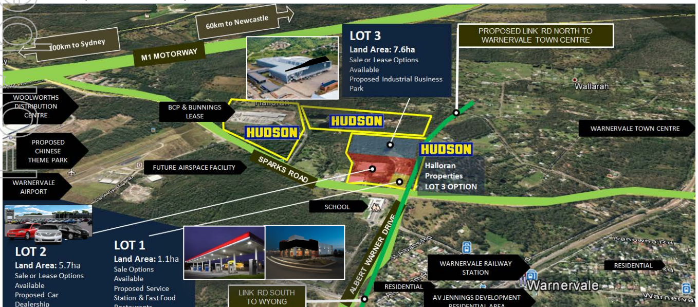
Figure 2: The Hudson Property and Lot 3 Option Location Map