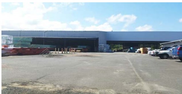
Figure 4: Industrial warehouse leased to Better Concrete Products and Bunnings