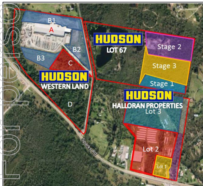
Figure 5: The Hudson Property is strategically located with existing and proposed development areas