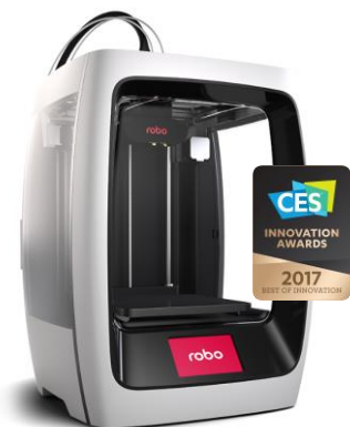
"Robo R2' Smart 3D Printer

The 'Robo R2 High Performance Smart 3D Printer with WiFi' is the newest addition to Robo's product offering – a full-featured Wi-Fi enabled 3D printer targeted at the "prosumer" segment of the desktop market. Validating this innovative new product, the 'Robo R2' Smart 3D Printer with Robo App for iOS was awarded the "CES 2017 Best of Innovation Award" for the 3D printing category at the Consumer Electronics Show (" CES "), the largest consumer electronics tradeshow, which took place this year from 5-8 January 2017 in Las Vegas, Nevada.