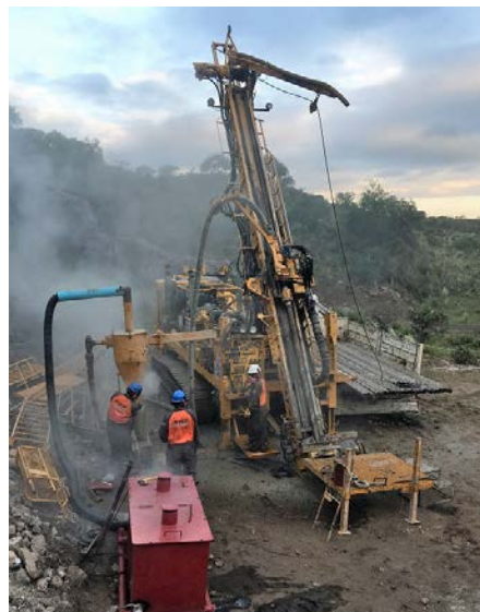
Figures 1 – 4. Setting up and commencing drilling at the Ancasti Lithium Project