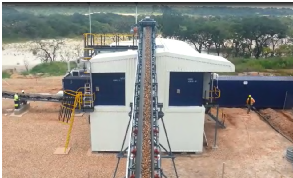
XRT large diamond recovery and new sorting house at Lulo

While the 227 carat stone is yet to be valued by our experts, it is expected to be worth in excess of the cost of the XRT unit.