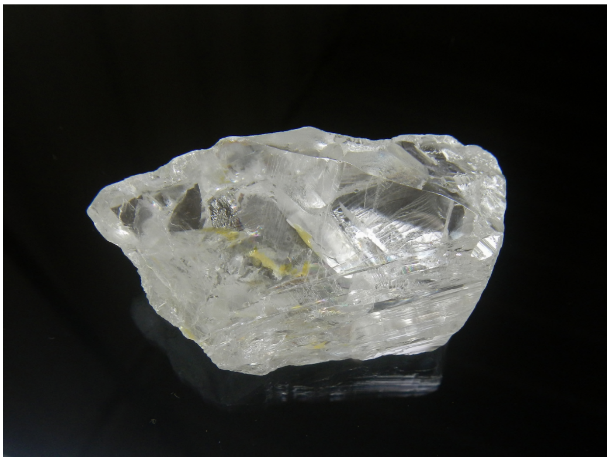
227 carat Type IIa diamond recovered at new Mining Block 28

Testing on a Yehuda colorimeter has confirmed the 227 carat diamond is a premium-quality Type IIa D-colour gem.