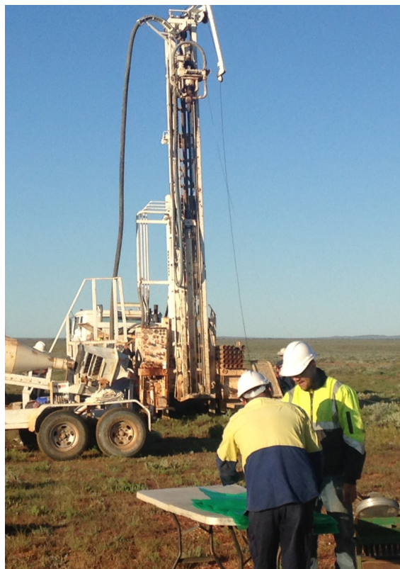
A successful drilling programme helped pave the way for a resource upgrade at the Hawsons Iron Project

"We are positioning ourselves to be first in the queue for development and the timing is right for Carpentaria."