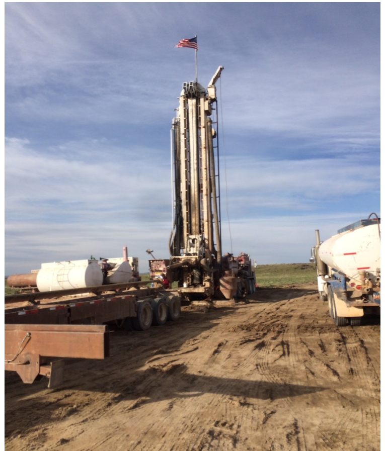
Red Valley: Drilling commences

The campaign is anticipated to be a circa 25 day drill program. Precise timing is dependent on weather, and quality of access to the other two drill locations. Conditions continue to improve however Utah has experienced an unusually high rainfall and late snowfall which has impacted some areas in terms of access for heavy equipment.