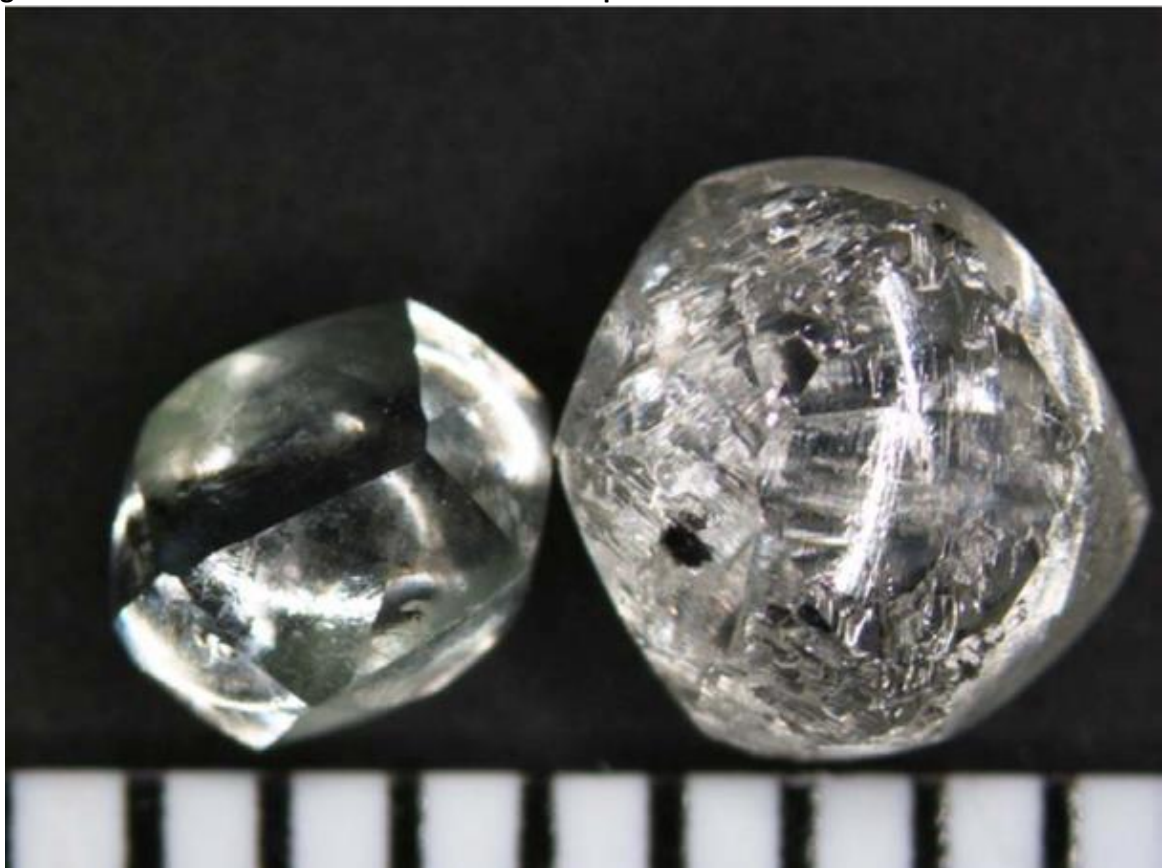
Figure 1: Selected diamond recovered from Blacktop in 2006 3

The diamonds were valued at the time by Diamdel, a De Beers diamond trading and marketing company, at US$52.56 per carat. Commenting on the diamonds Tawana reported that the valuers said that the parcel was unusual in that it contained no boart (low quality industrial) diamonds and that the presence of larger diamonds in a larger parcel would result in a higher valuation.