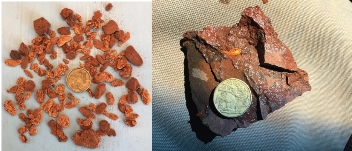
Figure 2: Gold nuggets, flat and rounded and up to 13 grams from Purdy's Reward 2 .

Purdy's Reward has all the approvals in place for ground disturbing exploration with a Heritage Survey completed and a Programme of Works approved by the Department of Mines and Petroleum for an extensive trenching and drilling programme. Novo plans to immediately initiate an aggressive trenching campaign over the next several months followed by drilling later this year, a highly effective approach that Novo have utilised to successfully explore for gold in their conglomerates at Beatons Creek.