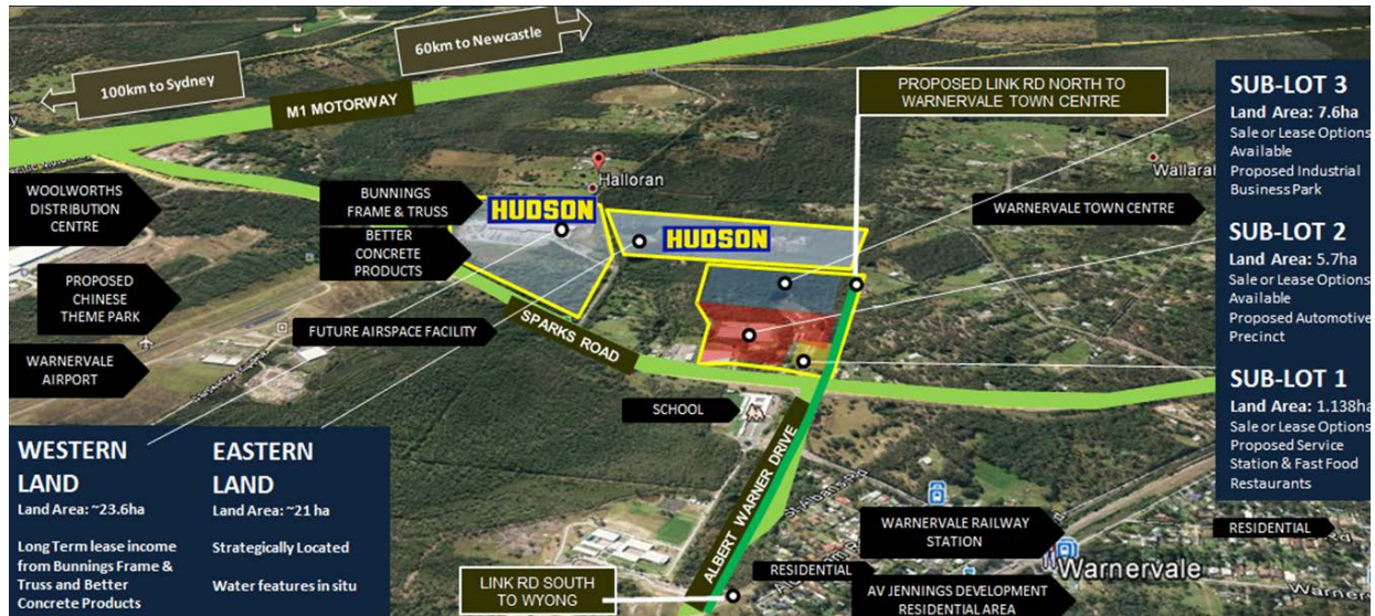
Fig. 2: Hudson Property Location Map

For further information, please contact: