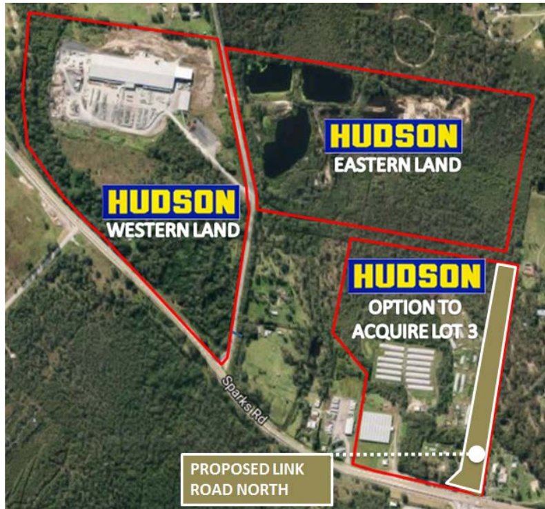
Fig. 1: Hudson Property Diagram