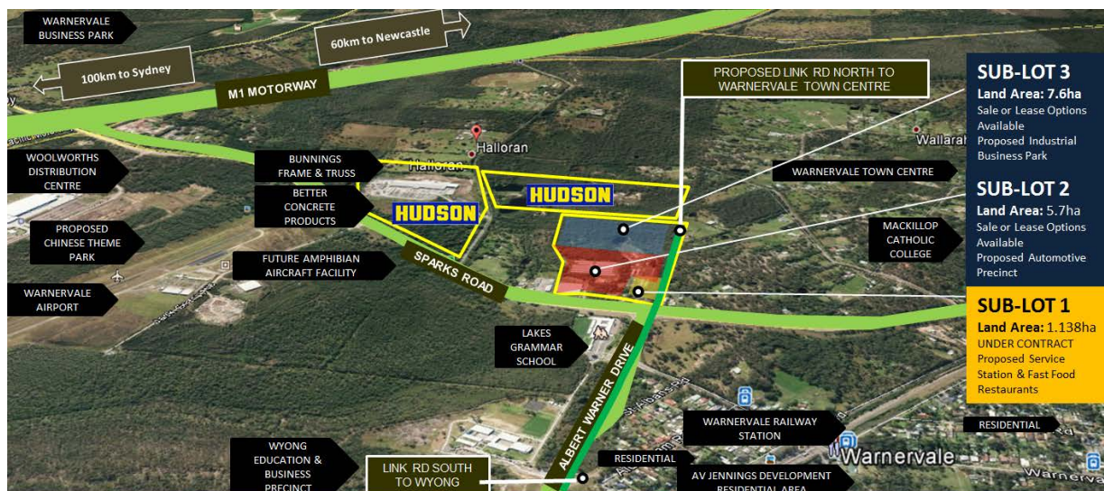
Fig 1. Diagram of proposed subdivision of Lot 3 into Sub-Lots 1, 2, and 3, as submitted to Council in October 2016.

Warnervale Project Pty Ltd is a wholly owned subsidiary of GWH Build. GWH Build is an independent property builder and developer specialising in industrial, commercial, hotel and residential projects in Eastern Australia. GWH Build operates from the Newcastle/Hunter region of New South Wales.