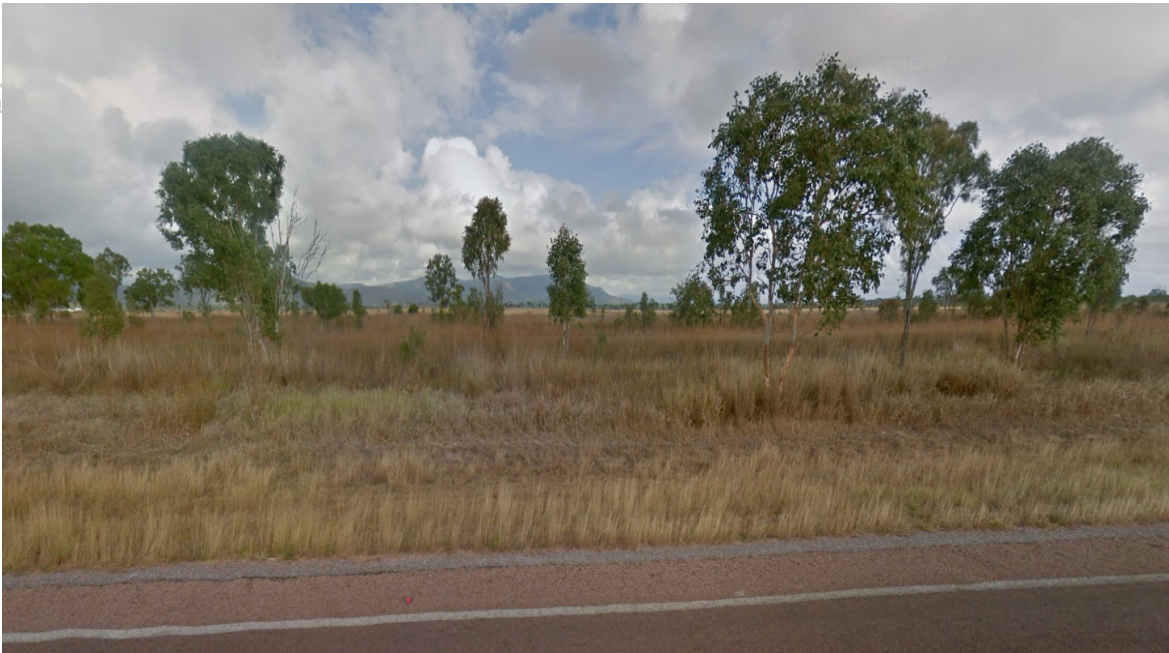
Figure 1 - Woodstock Site

consortium's criteria. Independent engineers, along with key members of the consortium, visited all sites and chose Woodstock as the most suitable location for the battery plant.