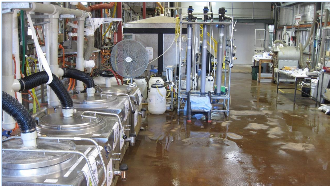
Figure 1 SiLeach™ Pilot Plant trial – Run 1B – lithium carbonate production at ANSTO Minerals pilot testing facility, Lucas Heights, NSW, October 2016.