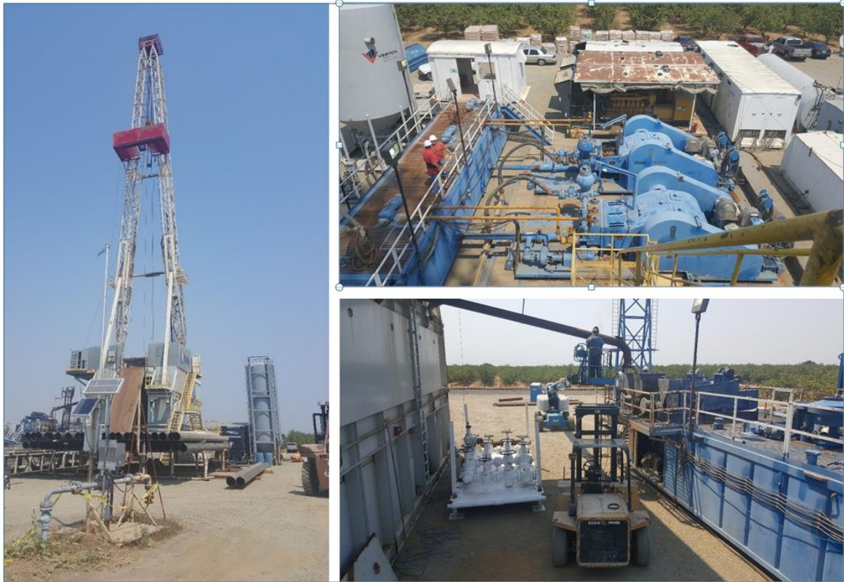
Figure 2: Rig #9 and associated equipment at Dempsey 1-15