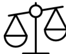
PUBLIC POLICY ADVICE