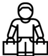
INTRODUCTIONS TO CRYPTOCURRENCY INVESTORS