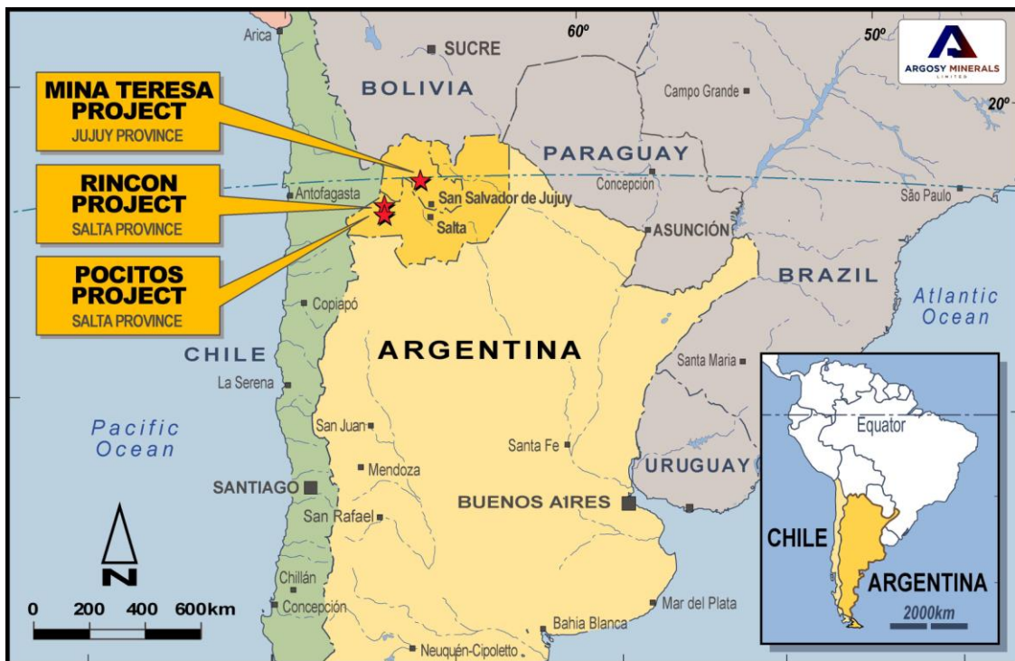
Argosy Minerals Limited – Argentina Lithium Project Location Map

The Company terminated the Heads of Agreement for the Mt Paris Project in Tasmania and the Farm-In Agreement for the Wee MacGregor Project in Queensland, and has resolved to relinquish its interest in the Erongo Graphite Project in Namibia.