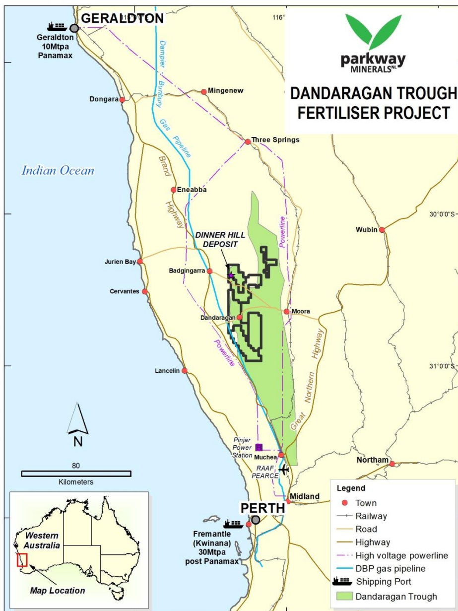
Figure 1 Location Plan – Dandaragan Trough Fertiliser Project

The project tenements cover two virtually horizontal greensand formations within the Cretaceous Coolyena Group: the Poison Hill Greensand and the Molecap Greensand. Over most of the area of the project they are separated by the Gingin Chalk and in places are underlain by a thin pebble horizon containing phosphatic nodules. An average thickness of about 11m of surficial, mostly sandy, cover overlies the greensand units. The greensands and the chalk contain significant amounts of phosphate as grains and nodules of fluorapatite. They also contain significant potash within the mineral glauconite.