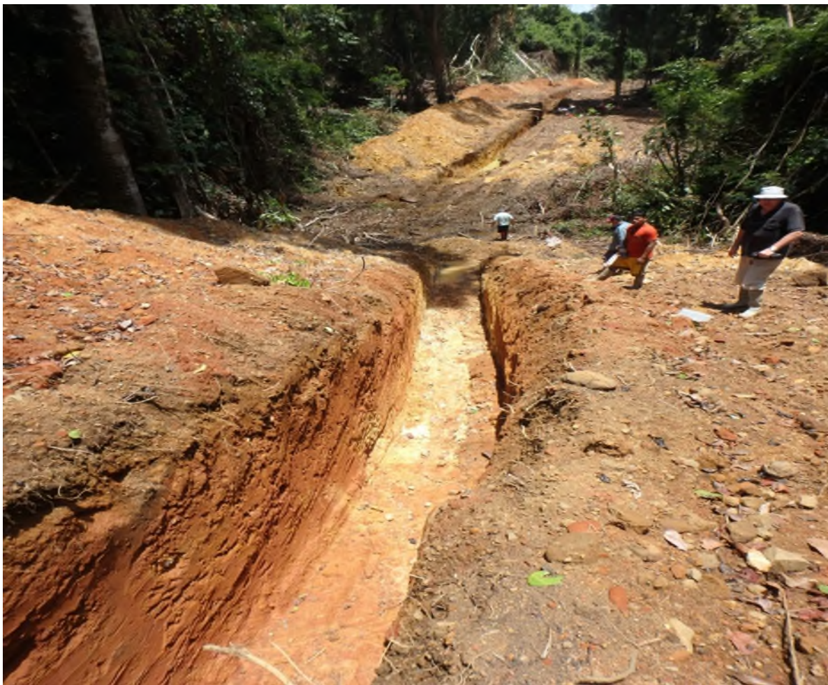
Image 2. Trenching at Turesi

Scintillometer readings with anomalous total count correlate strongly with Li-bearing pegmatites and transported material zones containing Li-rich pegmatitic boulders.