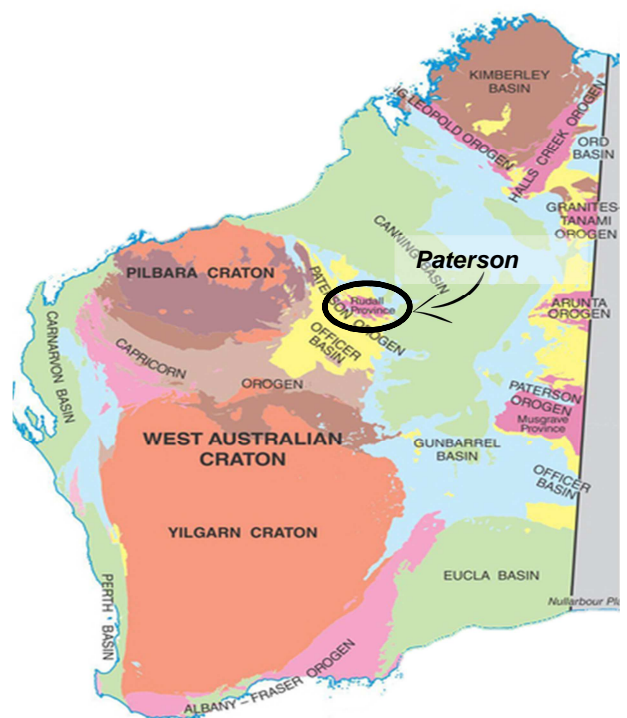
Figure 1 Paterson Province Projects Location Map

Exploration activities have commenced with the acquisition of samples and data previously acquired by a third party, the assessment of which will inform and shape our exploration work program for the Sunday Creek project.