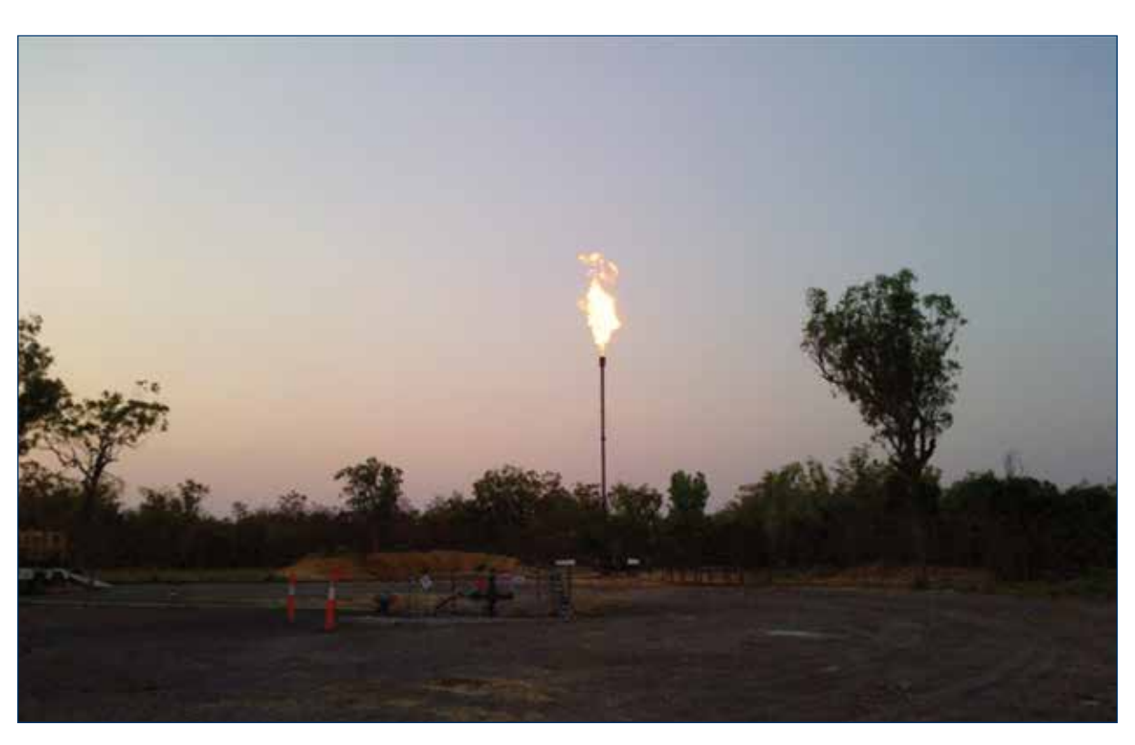
Production testing at Waggon Creek-1.