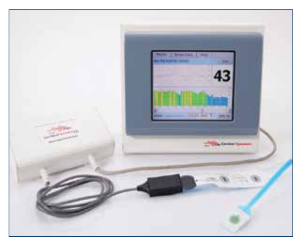
Corticals Brain Anaesthesia Response (BAR) Monitor.

Liver cancer ranks as the second leading cause of cancer-related deaths in developing countries. An estimated 782,500 new cases of liver cancer and 745,500 deaths occurred worldwide in 2012, of which