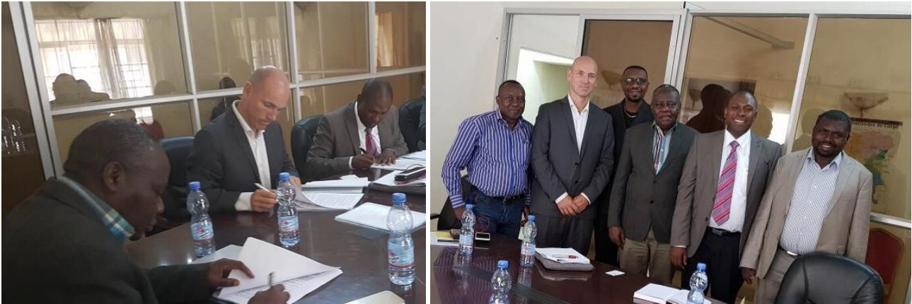
Figure 1. Signing of the Kitotolo Lithium Project Joint Venture Agreement and associated documentation with Cominiere SA

The Company will hold a 70% interest in the Joint Venture, with Cominiere SA holding the remaining 30% interest and receiving a 1% royalty on production from the Kitotolo Lithium Project.