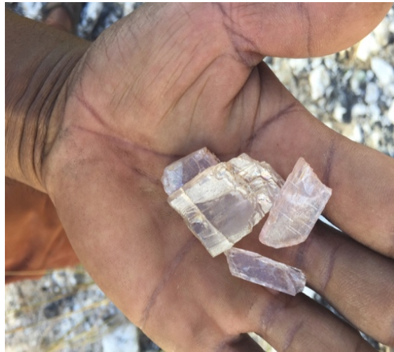
High purity Spodumene crystals discovered at Millie's Reward

Adjacent to the project area is the Holcim Talc Mine, which has a sealed road for product transport and grid power installed. In addition to the potential access of this infrastructure, Millie's Reward has extensive water supplies, accommodation and an available local workforce.