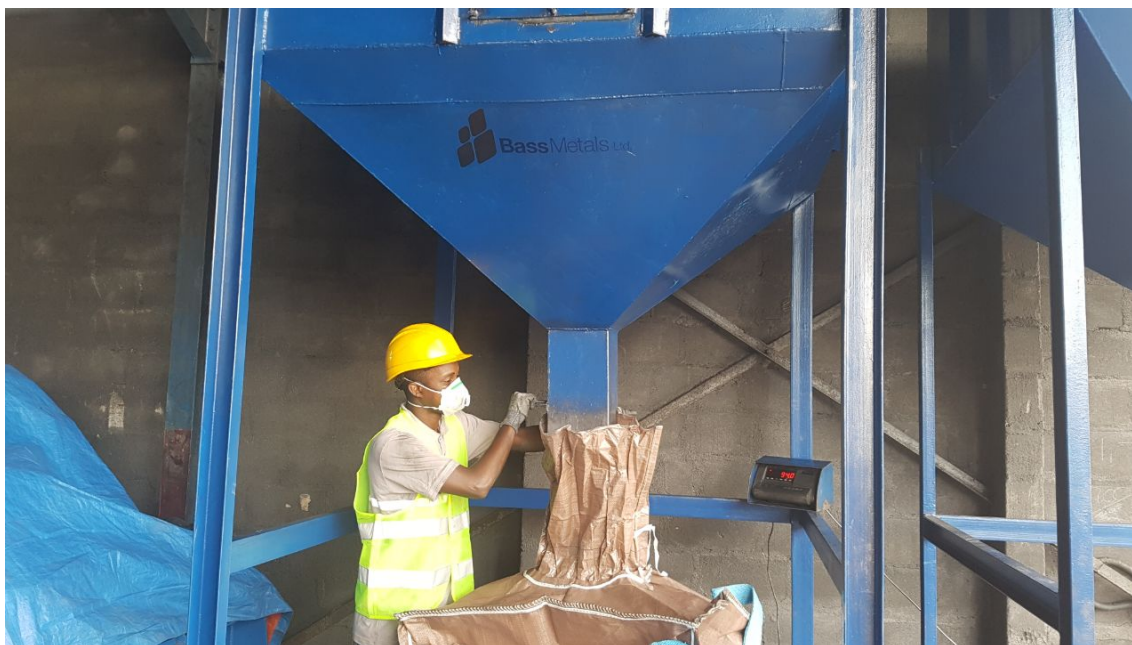
First production from the recommissioning process.

Bass Metals Limited (ASX: "BSM") (the "Company") is pleased to announce that the recommissioning of the Graphmada Graphite Mine, located in Madagascar, has commenced.