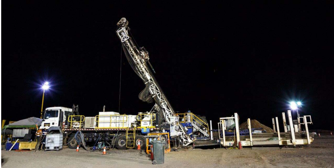
Exploration rig on site at the LCEP

The scope and objectives of this program are to: