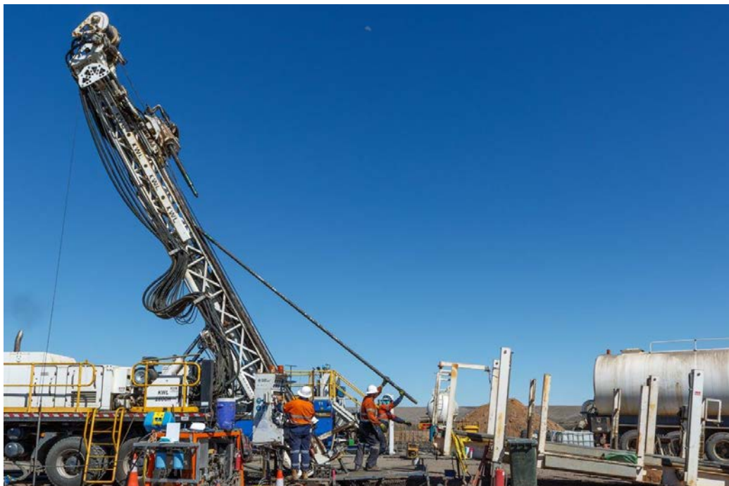
Drill rig on site at the LCEP

LCK is pleased to report that the first two holes have been completed and the final hole will be completed this week. This has enabled the Company to provide the Regulator with additional geological data so it can fully assess the suitability of the proposed PCD site. Significantly, LCK has reaffirmed that there are no significant geological structures in proximity to the intended PCD Gasifier location.