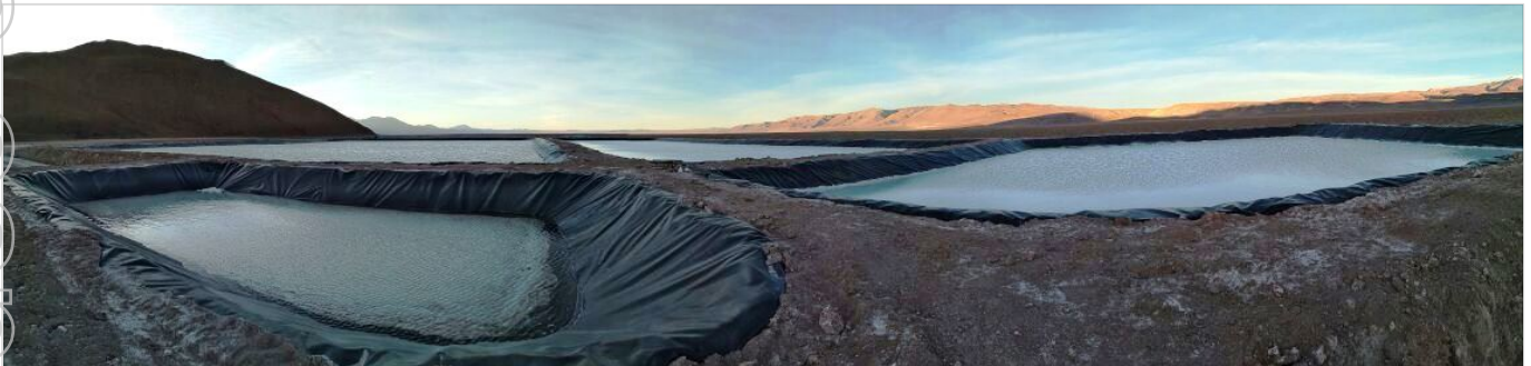
Photo 3. Rincon Lithium Project – Stage 1 Evaporation Ponds with Lithium Concentrate (panorama view)

The Company's Stage 1 evaporation ponds, continuously concentrating lithium brine since April 2017, are progressing to a suitable lithium concentrate for processing through the Stage 1 pilot plant.