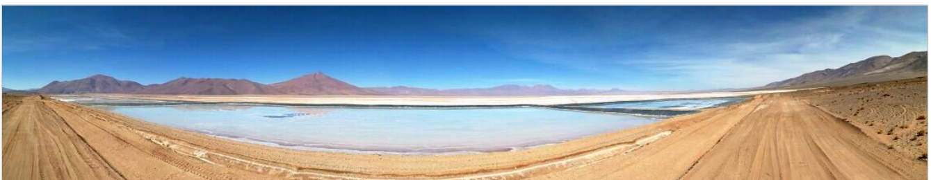
Photo 1. Rincon Lithium Project – Stage 2 Evaporation Ponds filled (panorama view)

With the initial lithium brine pumping works completed, the Company has now planned additional pumping tests to commence this week on the completed two production wells to measure flow rates among other testing for future analytical / study works. From field observations and the positive effect of the lithium brine pumping works into the Stage 2 ponds, the Company considers the two completed production wells will provide ample lithium brine volumes for consistent Stage 2 brine pumping operations.