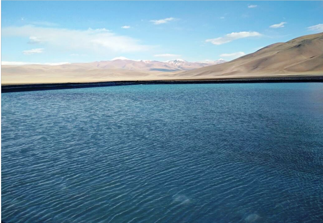
Photo 2. Rincon Lithium Project – Stage 2 Evaporation Ponds filled

The Company has continued to fast-track progress of its Stage 2 development works program by submitting the necessary regulatory application documents to construct the remaining Stage 2 evaporation ponds. Pending receipt of successful regulatory approval and permits, the Company will immediately thereafter commence such works, which will result in a combined total of ~34 hectares of completed Stage 2 lithium brine evaporation ponds.