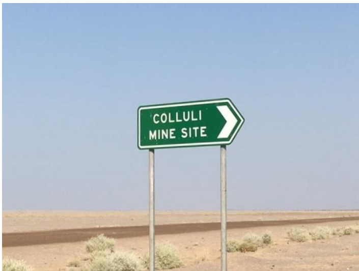
Figure 1: Turn off from the coastal road to Colluli