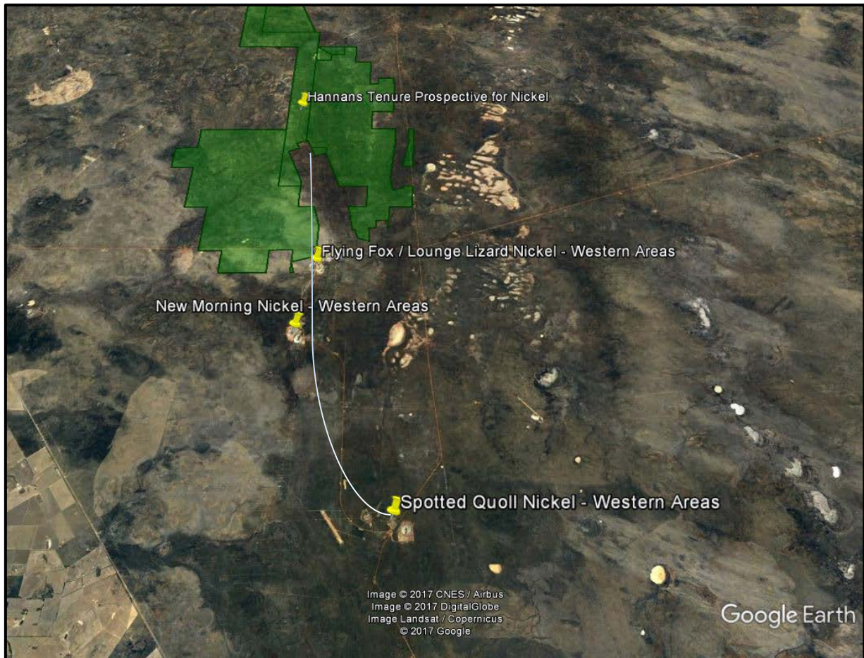
Figure 5: Hannans owns 100% of the nickel rights in the green tenements which are interpreted to cover the western ultramafic unit that hosts the world class Spotted Quoll and Flying Fox operating nickel sulphide mines owned by Western Areas Ltd.

Hannans' Forrestania nickel project is located along strike from world class operating high grade nickel sulphide mines owned by Western Areas Ltd (ASX:WSA). Hannans will focus its resources on exploring for economic lithium deposits at Forrestania and will therefore seek a joint venture partner to share the risks and rewards of exploring this world class nickel sulphide province.