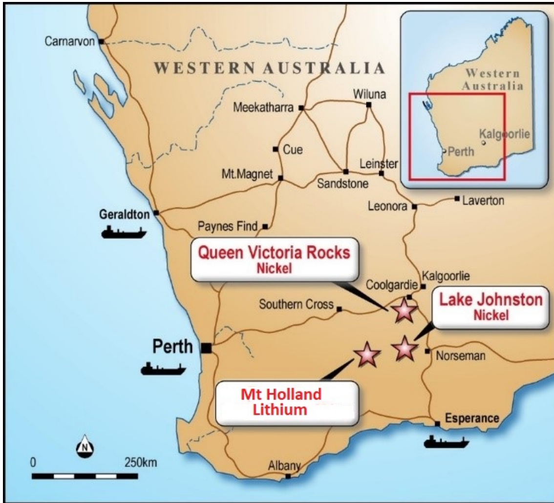
Figure 1: Location Map showing Hannans' Forresteria/Mt Holland Projects and Queen Victoria Rocks Project and Lake Johnston Joint Venture Project (Hannans free-carried) and location of major lithium mines and projects in the south-west of Western Australia

Hannans' Mt Holland Lithium Project is located adjacent to Earl Grey, a globally significant lithium deposit jointly owned by the world's largest producer of lithium and Kidman Resources Ltd – Earl Grey will underpin a world-class long-life integrated lithium project 1 . Hannans major shareholder is Neometals Ltd, a leading Australian specialty minerals company and minority owner of the producing Mt Marion lithium mine. Hannans aims to comprehensively test its 100% owned Mt Holland Lithium Project 2 with the aim of discovering a lithium deposit comparable to Earl Grey. Exploration activities including drilling (shallow and deep), surface sampling, mapping and geophysics will be ongoing at Mt Holland during the next six months.