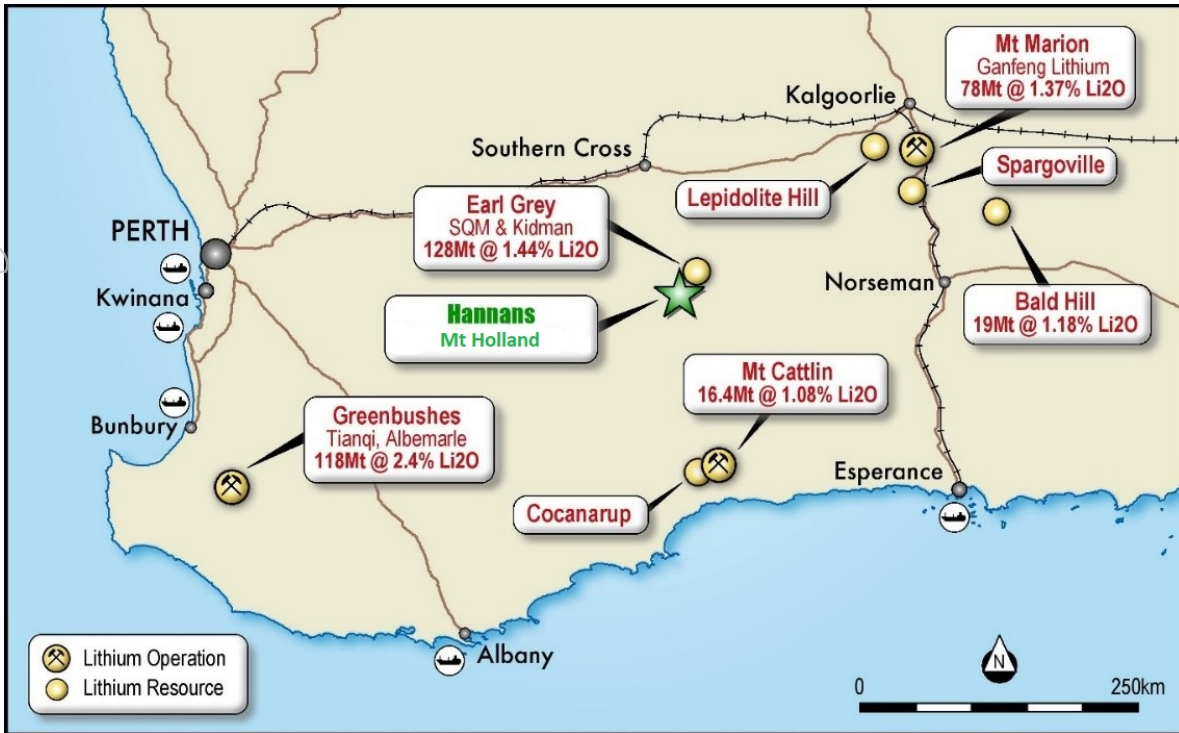
Figure 2: Location Map showing Australia's only three producing lithium mines (Greenbushes, Mt Marion and Mt Cattlin) and lithium exploration projects