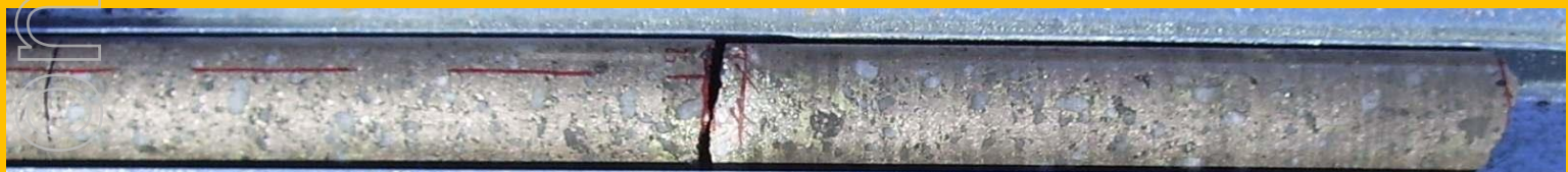
Mutooroo massive sulphide ore – grading approximately 2.3% copper and 0.25% cobalt 1