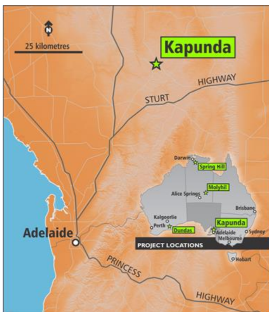
Figure 1. Kapunda Location Map

"We look forward to updating investors regularly as news on this project becomes available."