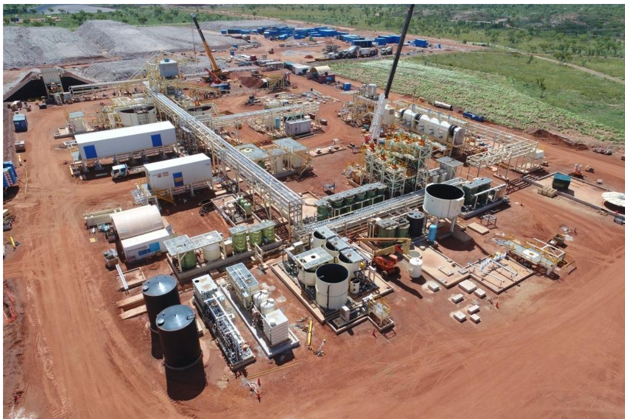
Browns Range Pilot Plant Construction at 28 Feb 18 with Product Estimated to be Shipped from Sept 18 Quarter