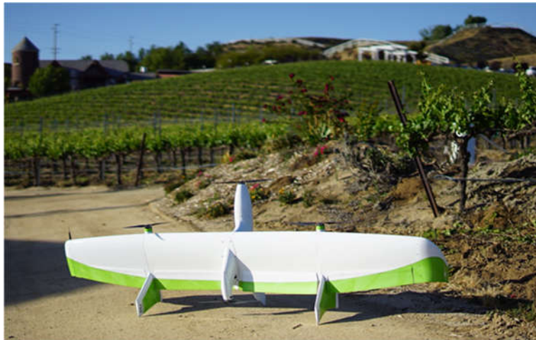
Swift020.a Agricultural Edition UAS