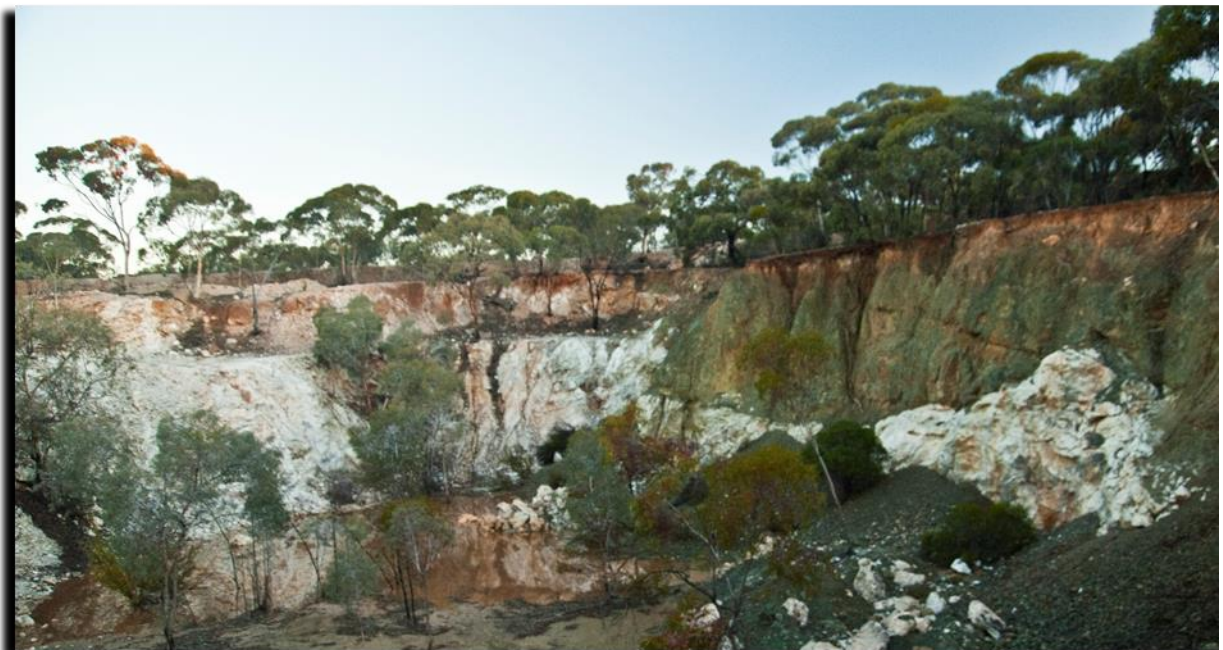
Figure 4: Thick pegmatite exposed within the walls of the Lepidolite Hill quarry, 520 km east of Perth, Western Australia.

TOMRA Sorting Solutions carried out the testwork on bulk samples obtained from dumps surrounding the historic mine workings at Lepidolite Hill. The ore-sorting tests indicate the possibility of rejecting a large proportion of the waste material, thereby reducing the required capacity of the ore-preparation section