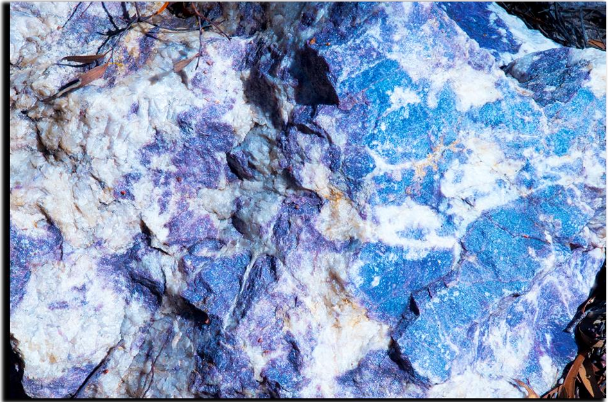
Figure 3: Lepidolite (blue-purple) with quartz, feldspar and accessory spodumene, petalite and pollucite.

In the 1970s, petalite (a lithium aluminosilicate) was recovered during mining operations but the abundant lepidolite also mined in the 400,000-tonne campaign was consigned to the dumps. That lepidolite is associated with accessory petalite, spodumene and pollucite (a cesium mineral).