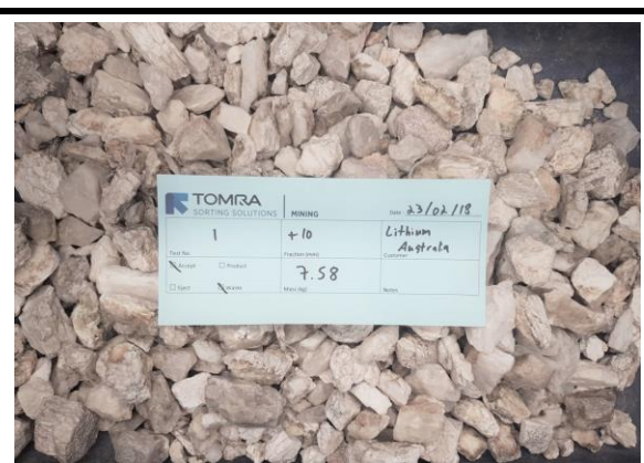
Figure 2: Ore sorting reject (mainly feldspar) from Lepidolite Hill mine dumps.

At Lepidolite Hill, the lithium mineralisation consists of petalite and lepidolite in a thick pegmatite that remains exposed in the quarry walls, with further large lepidolite accumulations exposed at surface at the southern end of the of the quarry.