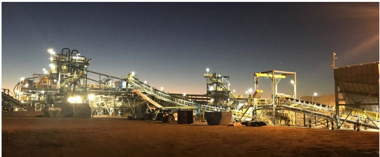
Figure 2 | DMS plant