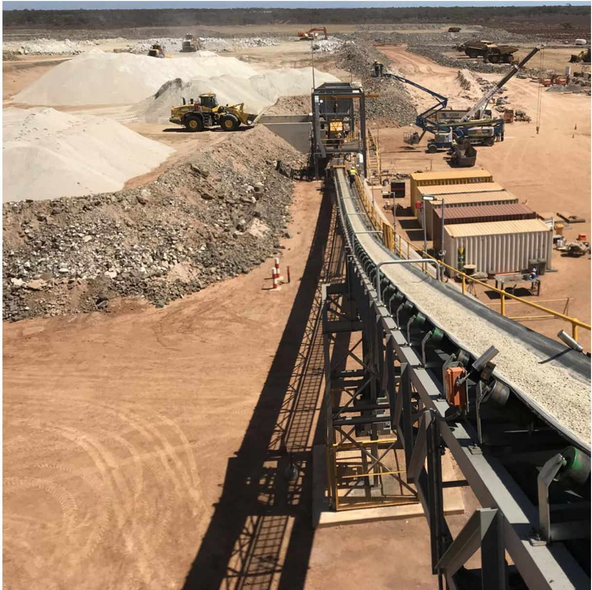
Figure 1 | Ore Feed