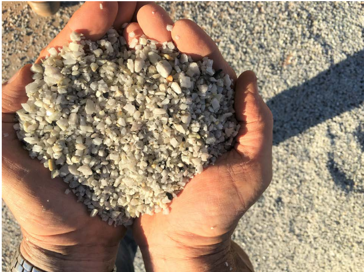
Figure 5 | Spodumene concentrate