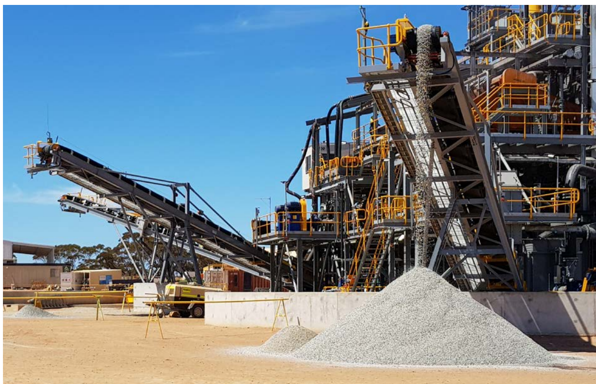
Figure 4 | Stockpiles