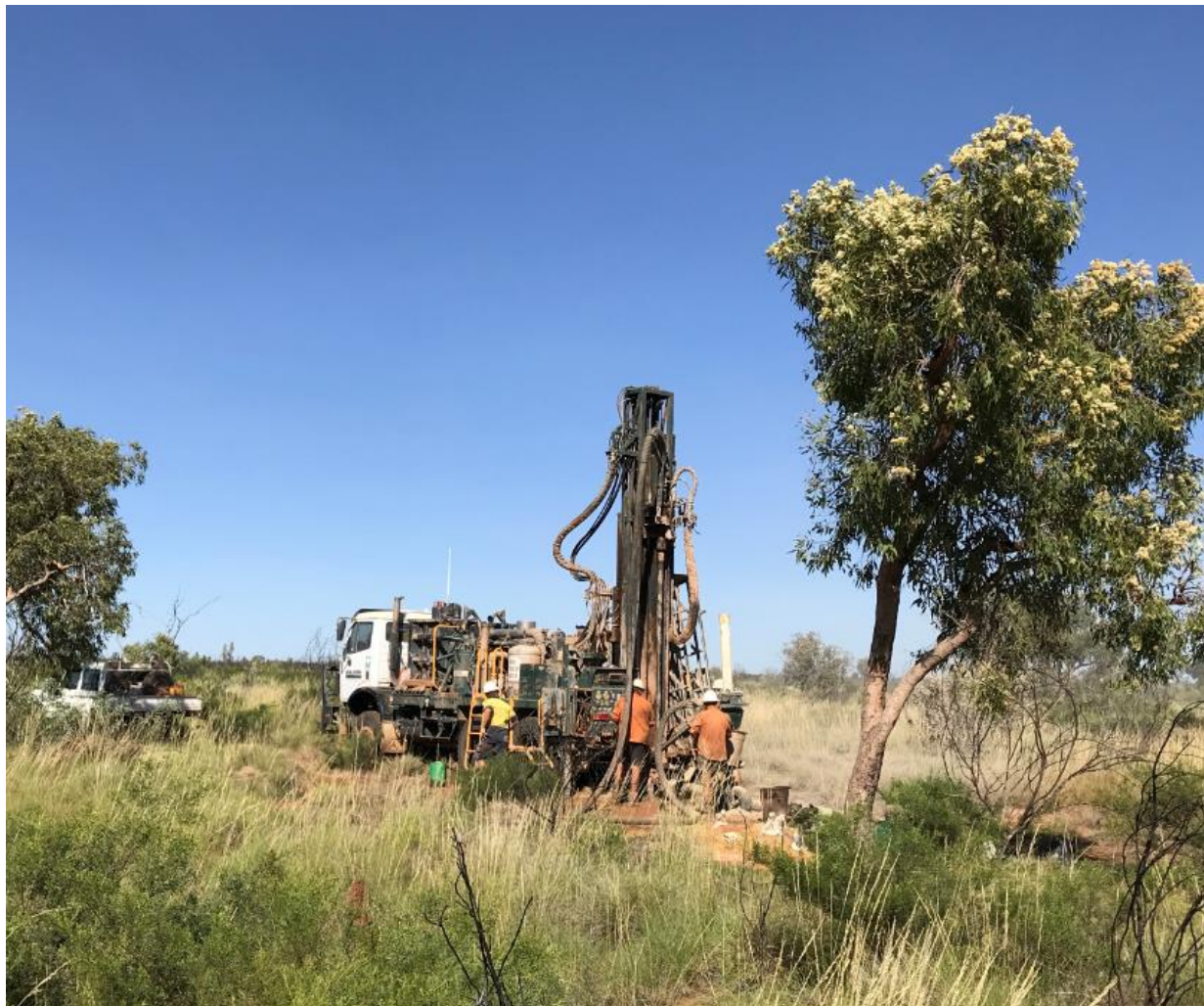
Figure 1. Aircore drilling underway at the Capstan Prospect