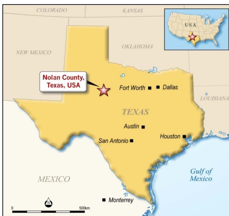
Location of the Company's 17,402 net acres in Nolan County, Texas

Winchester was established in 2014 with the preliminary objective of acquiring oil and gas leases and working interests (WI) in areas situated on the Eastern Shelf of the Permian Basin in Texas, USA, a location which offers a host of prospective conventional and unconventional oil opportunities at shallow depth together with attractive conventional oil targets in the Ellenburger Formation at slightly greater depth. Concurrent with establishing a dominant land position in the Permian Basin, Winchester commenced exploration drilling with subsequent oil and gas production achieved in 2015.