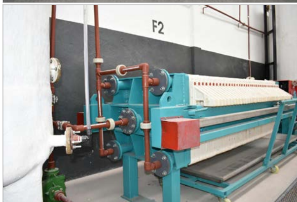
Figures 2-5. Rincon Lithium Project – Stage 1 pilot plant, on-site laboratory and storehouse