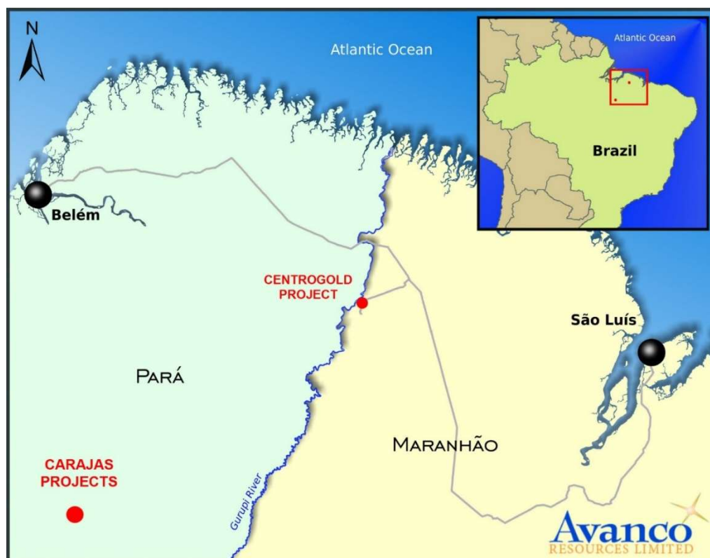
Figure 1 – Avanco's North Brazilian asset portfolio

Avanco's projects and exploration tenements are located in the Carajás Province in the state of Pará and the state of Maranhão (figure 1 below) in Northern Brazil. The Carajás province is widely regarded as a premier mineral province hosting a large concentration of large IOCG deposits.