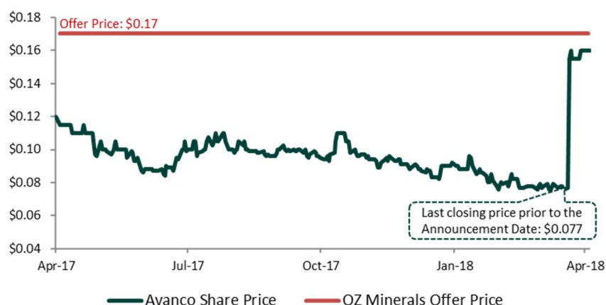
Avanco 12 Month Share Price