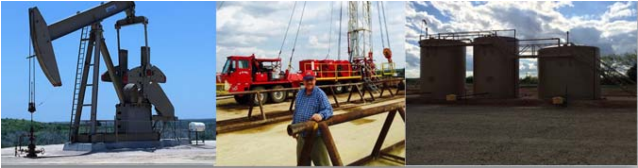
Winchester Energy field production & operations area, Permian Basin, Nolan County, West Texas