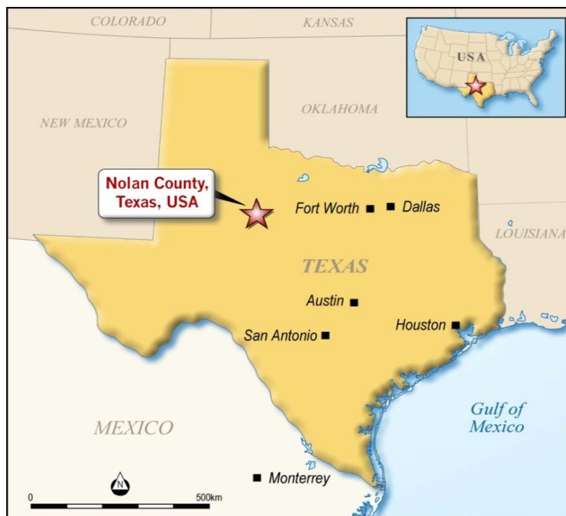
Location of the Company's acreage position in Nolan and Coke County, Texas, USA

* Please note that all oil and gas production is subject to royalty payments to the oil and gas rights owners. The figures represented above are for oil production only (and exclude gas sales) and are pre-royalty.