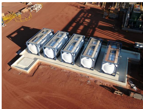
Figure 6: Acid Storage