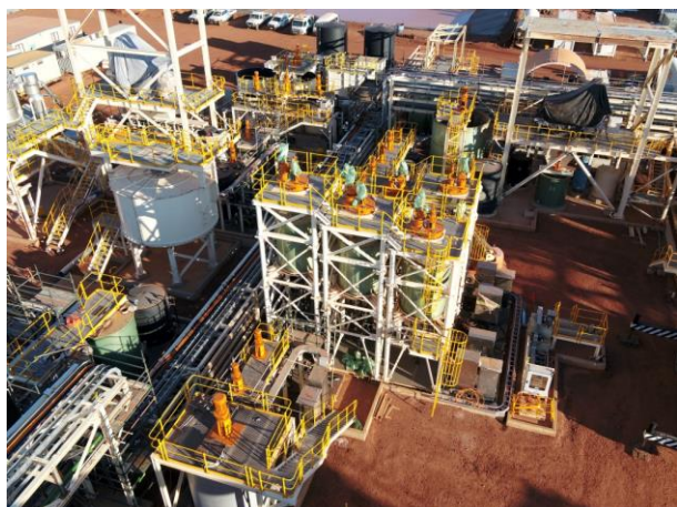
Figure 3: Water leach and CCD