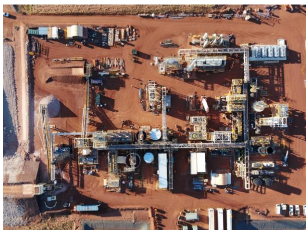
Figure 5: Process plant aerial view