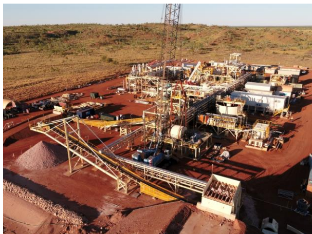
Figure 1: Crushed ore stockpile (left foreground)

The plant is on schedule for completion by end June 2018, with first production of heavy rare earth carbonate in the September quarter.