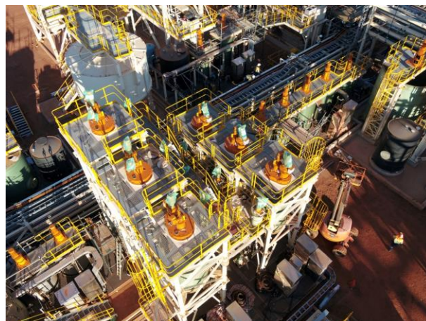
Figure 2: CCD and purification