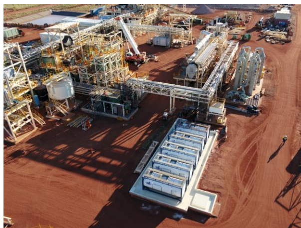
Figure 4: Acid storage, kiln and waste gas scrubber