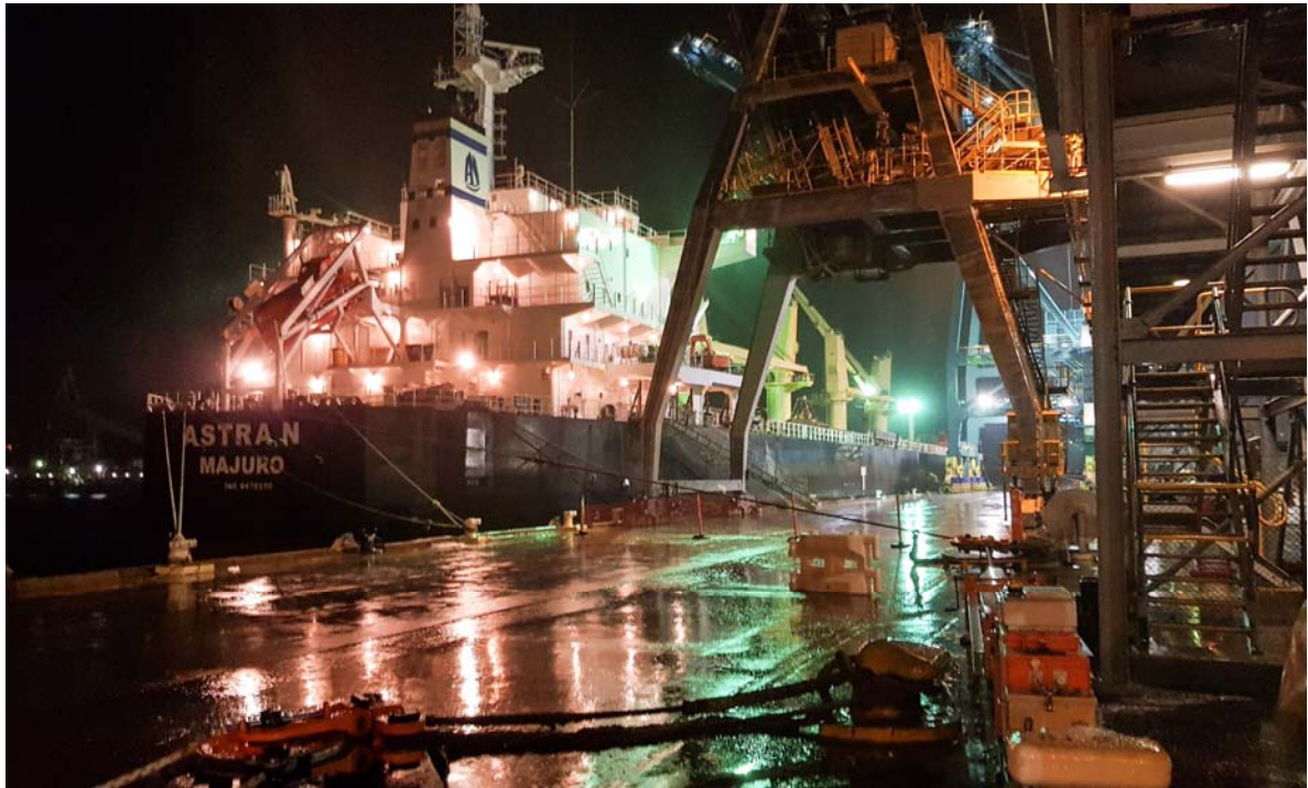
Figure 2 | Vessel Astra N at the Port of Esperance