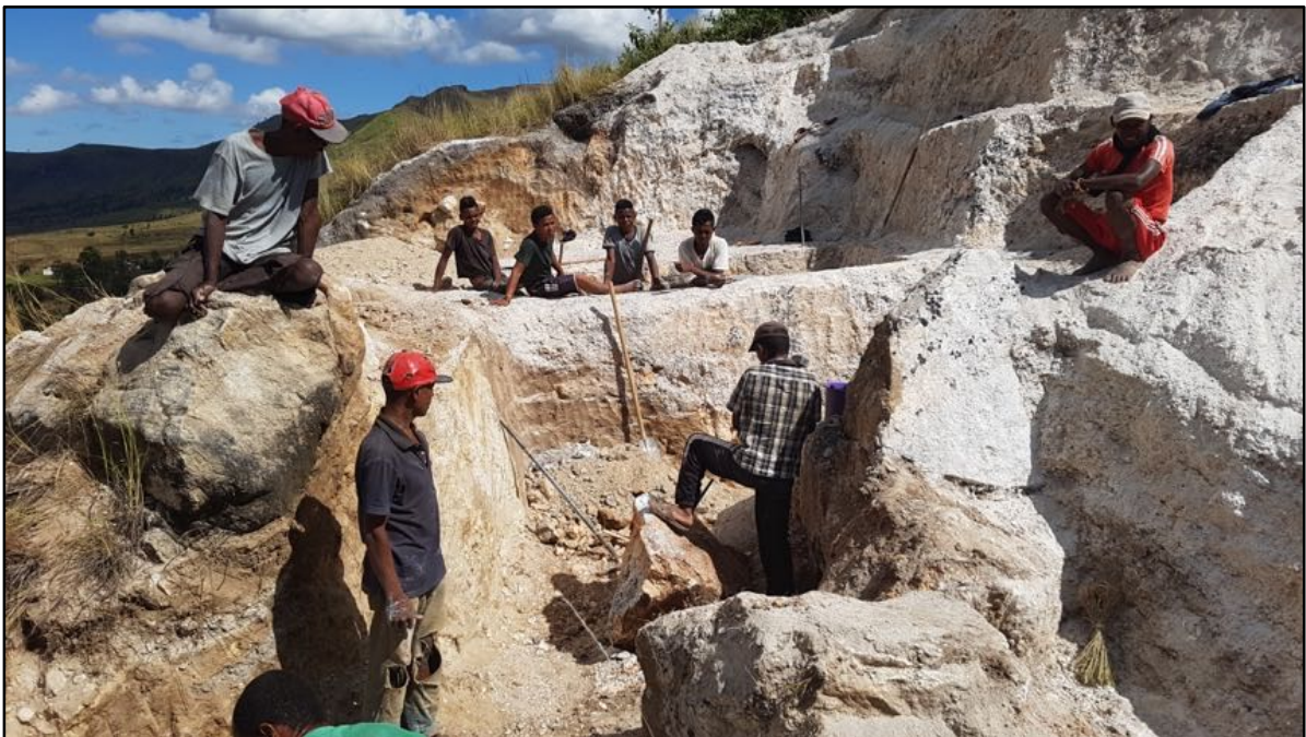
Figure 3: Sample collection at Tsarafara Prospect (spodumene-bearing pegmatite)