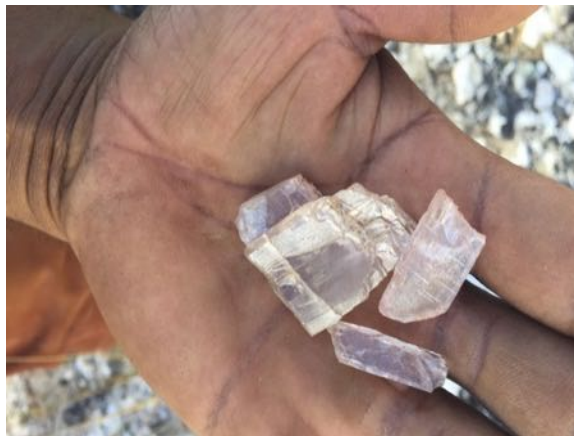
High purity Spodumene crystals discovered at Millie's Reward

Adjacent to the project area is the Holcim Talc Mine, which has a sealed road for product transport and grid power installed. In addition to the potential access of this infrastructure, Millie's Reward has extensive water supplies, accommodation and an available local workforce.