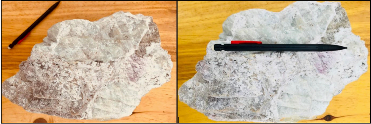
Figure 2: Samples from Ampatsikahitra Prospect (spodumene-bearing pegmatite)