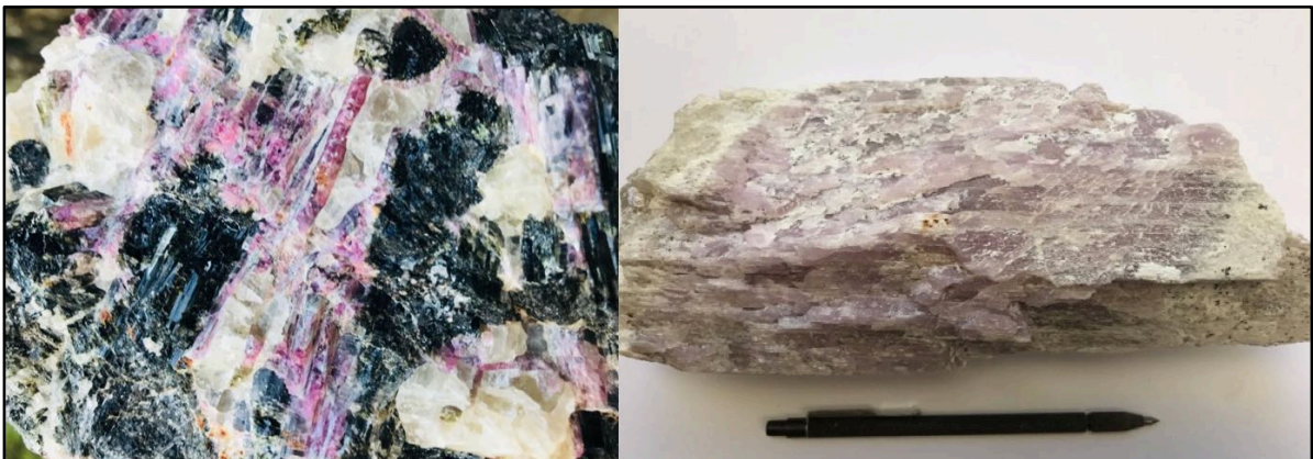
Figure 4: Samples from Tsarafara Prospect (spodumene-bearing pegmatite)