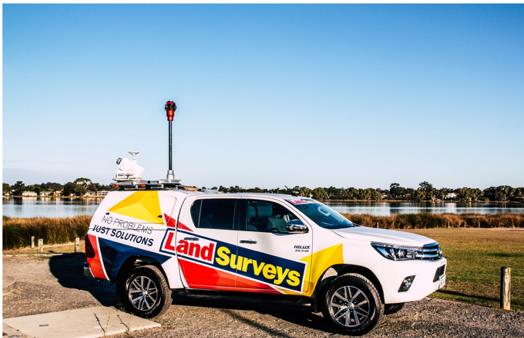
Land Surveys' recently acquired MLS platform

Under the terms of the Agreement, Land Surveys will procure the 3D MLS data, Pointerra will host the data and the two companies will share in revenue generated from the sale of access to the 3D data and the derived 2D mapping and analytics products. Land Surveys and Pointerra will be jointly responsible for marketing and selling the MLS datasets.