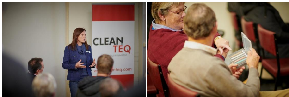
Figure 2: Clean TeQ's community consultation activities

The development of Clean TeQ Sunrise will support one of the most disruptive industrial transformations currently underway - the rapid electrification of the global automobile industry. Over the first decade of steady-state operations Clean TeQ Sunrise is forecast to produce high quality nickel sulphate and cobalt sulphate products in sufficient quantities to manufacture approximately 500,000 electric vehicles per annum 1 (using nickel-cobalt-manganese battery cathode chemistry). Over the initial 25-year mine life the DFS estimated: