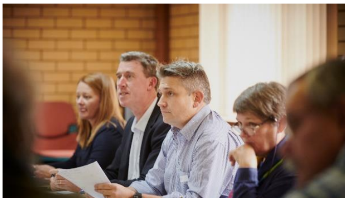
Figure 3: Clean TeQ's community consultation activities

"We are committed to working together with our host communities as we seek to maximise the benefits of our presence, manage any impacts through leading environmental practices and show respect and care for people as we go about our business. As the Project moves through the various horizons of development, we look forward to tapping into local talent and businesses. We have already received strong expressions of interest from individuals and businesses across Central West NSW who would like to be involved in Clean TeQ Sunrise. Having our people living in and contributing to a strong and vibrant local community is a priority."