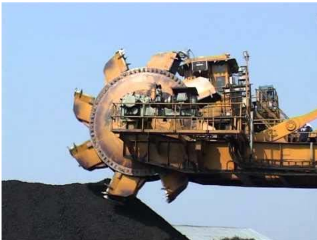
Liners in reclaimer buckets need frequent replacement