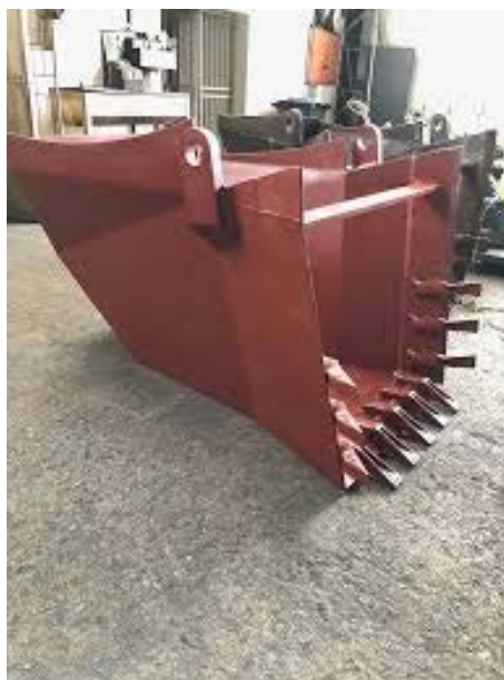
The ground engaging tools in the buckets are also subject to high wear rates