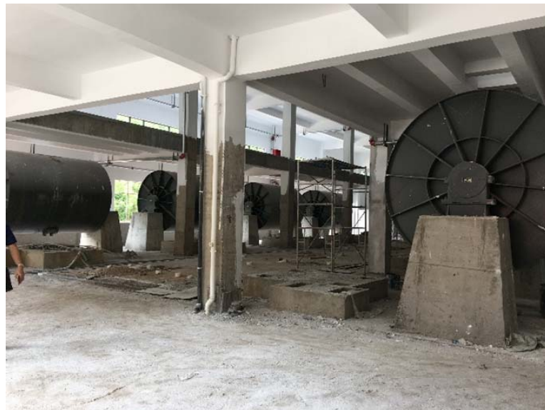
Figure 1 New major porcelain factory due to open in China in 2019 that wishes to lock in long-term supply of Carey's Well material

The Company previously signed a binding Heads of Agreement with Minotaur covering their Poochera Halloysite-Kaolin Project. ADN has now completed its due diligence investigations, and has exercised its option to enter into the Joint Venture.