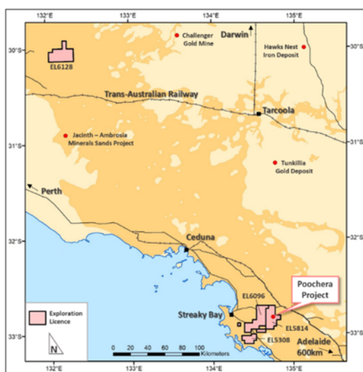
Figure 3 Project location plan

The Halloysite-Kaolin Project covers two main geographic areas of interest, both situated in the western province of South Australia (Figure 3). The main area of focus, the Poochera Halloysite-Kaolin Project on the Eyre Peninsula comprises three tenements and is located approximately 635kms west by road from Adelaide and 130kms east from Ceduna (Figure 4). The port of Thevenard at Ceduna offers export facilities appropriate for likely future production.