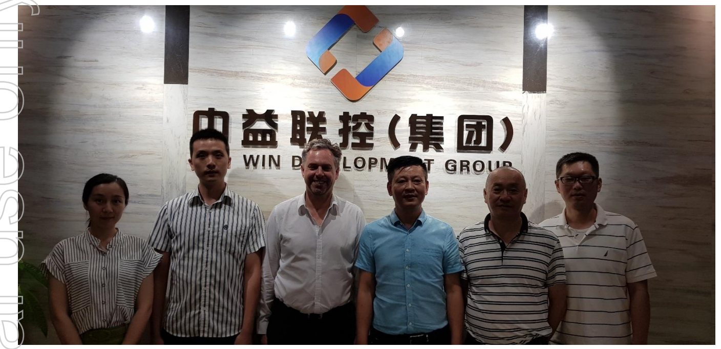
Figure 1. Win-Win Management team with AVL at Win-Win Development Group Head Office in Chengdu.

to Chengdu included visits to the Win-Win offices (Figure 1) and a site visit to the operating VCN plant at Win-Win's sister company (Figure 2).