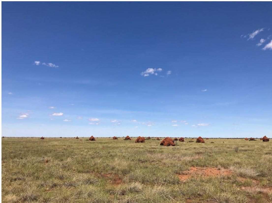
Figure 2. Flat topography with minimal areas of outcrop at the Euro Project.

Prodigy Gold can elect to co-fund all future exploration and development or dilute its interest and convert to a 1.5% net profit royalty if the interest dilutes to 10% or below.