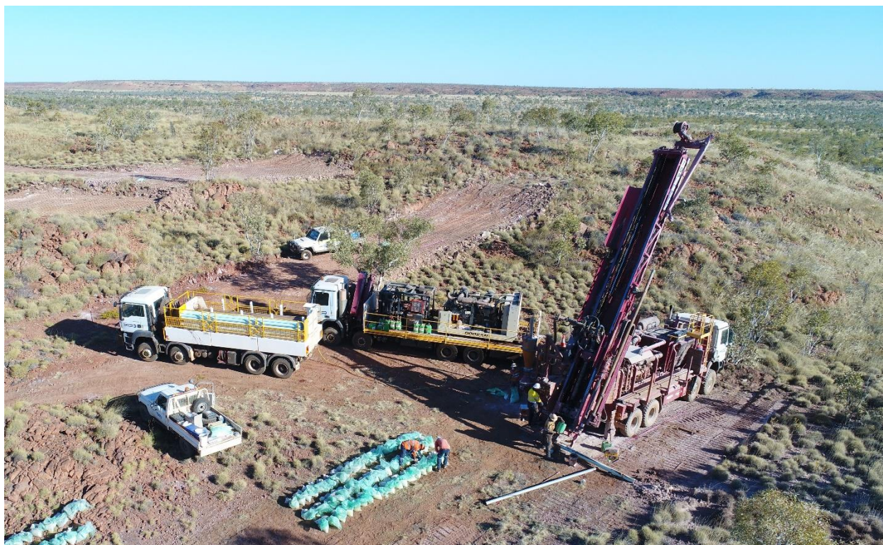
RC drilling underway at Banshee South prospect

In this context, the Company has prioritised exploration targets for assessment during the Pilot Plant Project. The first program will assess the Banshee South, Dazzler, Gambit East and Polaris prospects, all identified during earlier drilling campaigns, while the Iceman prospect will be drill tested for the first time (see figure below). First-pass drilling will also take place, along strike to the west of the Wolverine and Gambit West deposits, both of which underwent trial mining in late 2017.