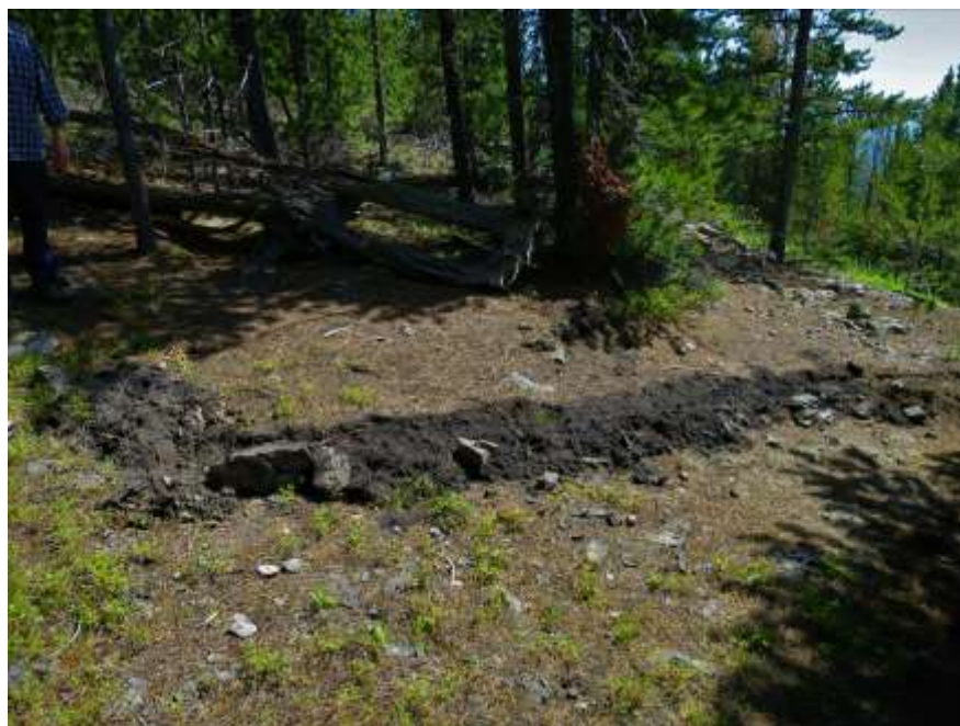
Figure 5. Field surveying at Elan South providing drill targets