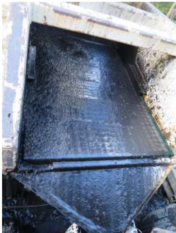
Figure 4. Coal cutting collection during drilling