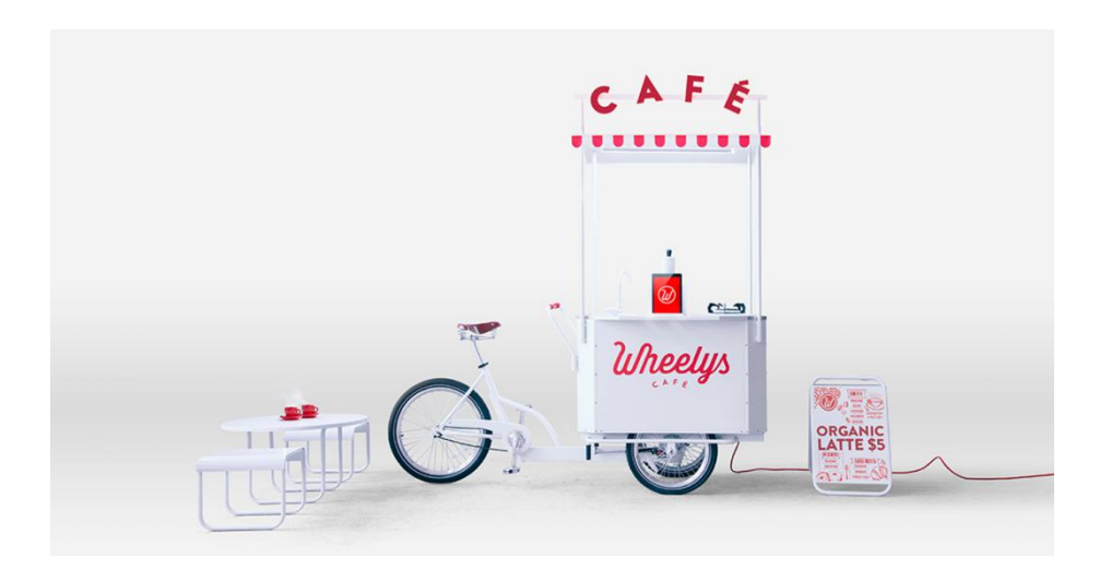
Image 1 (Top) – The 'Wheelys Mini' Café'. Image 2 (Bottom) The 'Wheelys Science Station'.

Wheelys Inc ("Wheelys") is a rapidly growing food and beverage franchise company that sells a complete café, which is built around a bicycle. The company offers a variety of versions and upon purchasing the mobile café, the owner becomes a Wheelys franchise owner. Revenue streams are generated from the sale of the bicycles themselves and ongoing sales from the supply of coffee and peripheral products. Wheelys has an established base of investors from Silicon Valley and currently has over 800 cafes operating across 70 countries. The business is currently experiencing a rapid growth stage, with the number of mobile cafés increasing from around 180 to over 800 between 2016 and 2017.