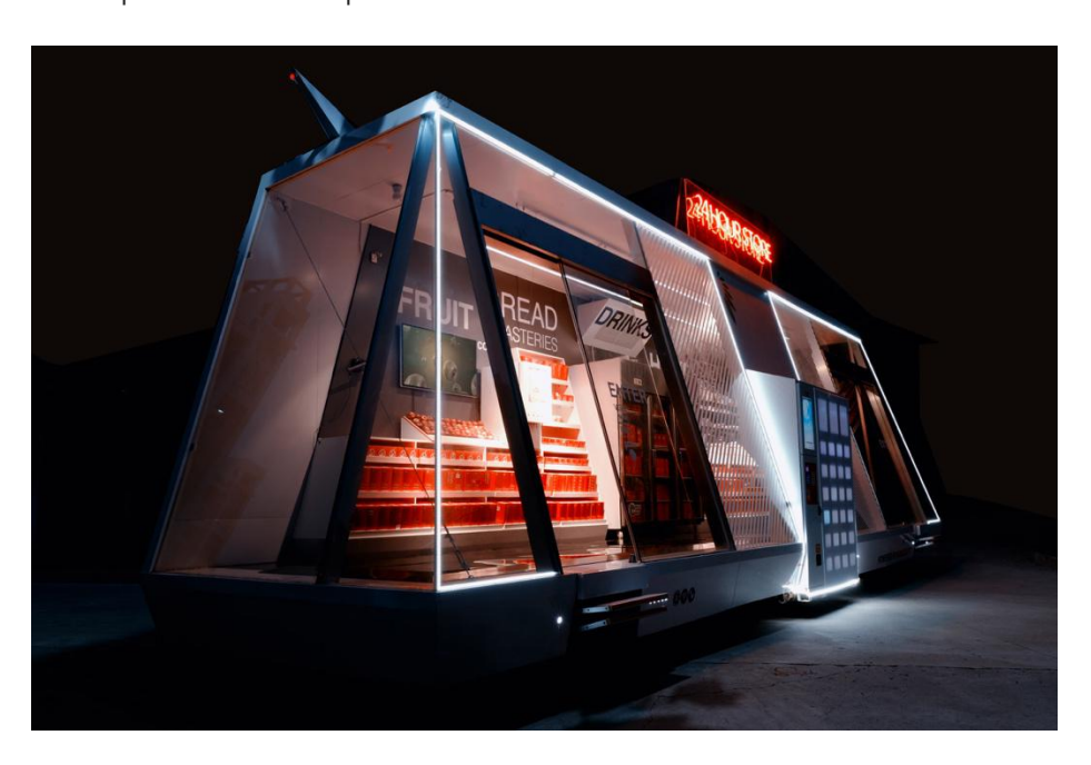
Image 1 (Top) – The Moby unmanned retail store viewed from the outside Image 2 (Bottom) - The interior of the Moby unmanned retail store.

White Whale AB trading as Moby ("Moby"), is a newly launched company stemming from Wheelys and is the world's first autonomous, unmanned, mobile retail store. Moby is currently in testing stage in Shanghai with sales occurring 24 hours a day. A number of the prebuilt stores have already been sold to customers with plans for greater development and expansion over 2018 and 2019.