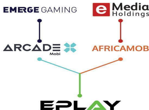
Figure 3: EPLAY Platform Partnership

Integration of AfricaMob's airtime billing will allow EPLAY to seamlessly bill paying subscribers across South Africa on mobile networks such as MTN, Vodacom and CellC. The airtime billing integration will allow users to enter the platform and pay up to AUD$0.50 daily ($15 per month) to enter and play in tournaments hosted by EPLAY.