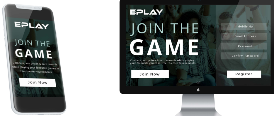
Figure 1: EPLAY branded Arcade X screenshots for PC and mobile

EPLAY will initially launch 40 of its best games to ensure mass adoption and long engagement. All games will be able to be played across all devices. EPLAY is set to launch on 1 August 2018.