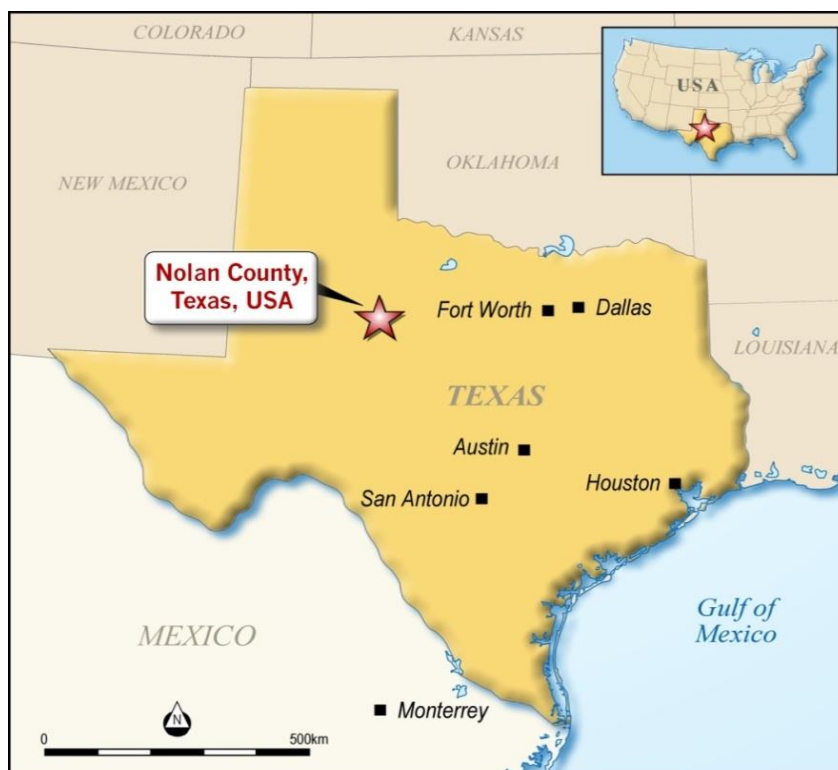
Location of the Company's acreage position in Nolan and Coke County, Texas, USA

* Please note that all oil and gas production is subject to royalty payments to the oil and gas rights owners. The figures represented above are for oil production only (and exclude gas sales) and are pre-royalty.